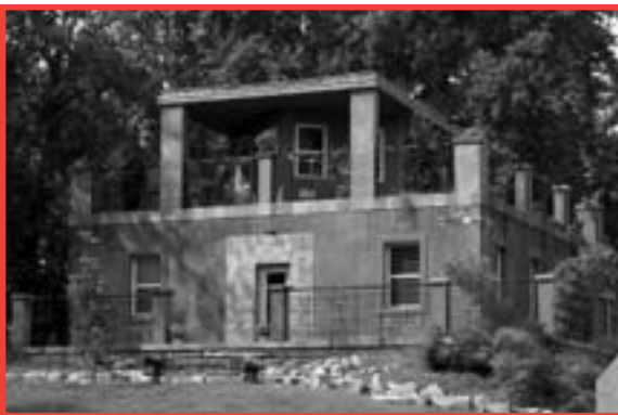
Site #1 302 South Leonard Street*