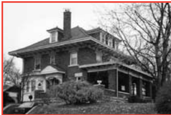
Site #3 416 South Leonard Street*