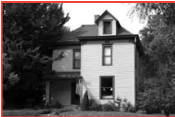
Site #2 308 South Leonard Street*

* Additional parking at Teague Lumber, 339 S. Leonard Street for Sites #1, #2, and #3