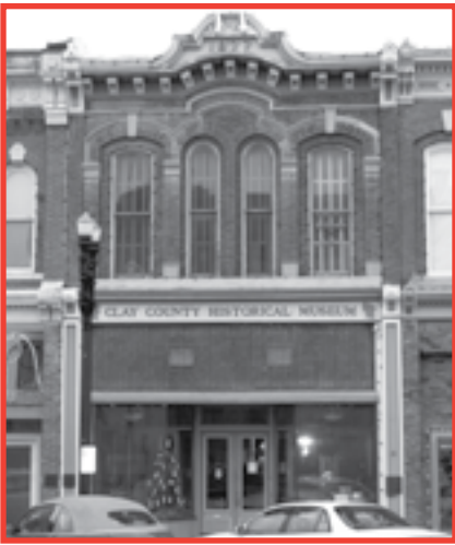
Site #5 The Clay County Museum 14 N. Main Street

Clay County Museum and Historical Society is housed in an 1877 building on the Square in Historic Downtown Liberty. Three floors of artifacts are on display in an original pharmacy with the doctor's office as it was at the turn of the century on the 2nd floor. Some snacks will be available.